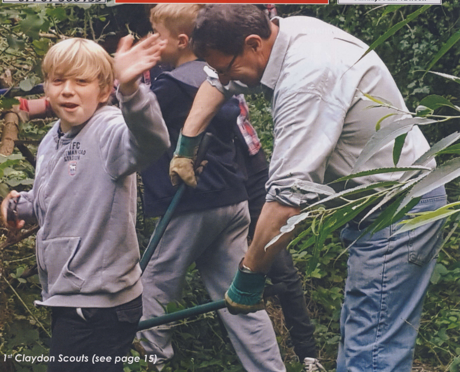
1 st Claydon Scouts (see page 15)

Open Mon-Sat 9am-5pm Sundays 9am-12 noon